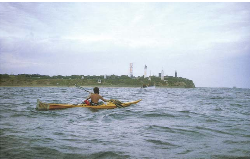
Approaching Shortlands Bluff, Queenscliff, on December 23, 1982