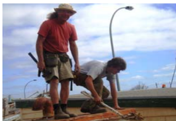
Carpenters repairing Shandon roof, February 2010

Two other vessels with the name Shandon are known to have plied Port Phillip waters including a paddle steamer and a conventional steamer.