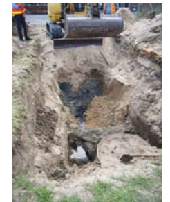
Lonsdale dig March 2006