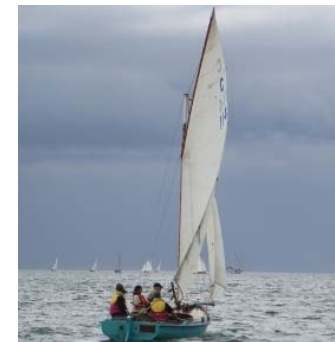
Queenscliff Cousta Boat Rosie in 2009 Regatta

The Sunday yacht race is a Sternchaser from the Main Pier, around into Lonsdale Bight and back home again. Yachts will start in succession according to their handicap, so onlookers will see a continuous procession of boats during the afternoon.