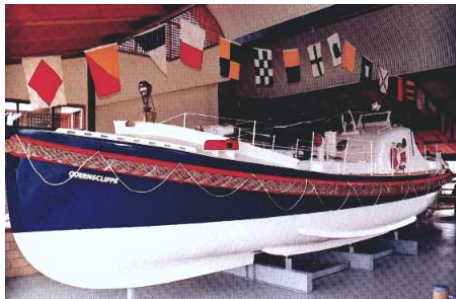
The restored Queenscliffe at rest in the Museum