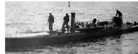
HMVS Lonsdale c.1905

Subsequently the Museum obtained funding for a new display to tell the Lonsdale story. A covered display stand has been erected in the grounds over the location of the buried Lonsdale hulk. An interpretive panel has been designed, to be mounted on the stand. We expect that this exhibit will be installed in the next few weeks. You will then be able to examine the full story.