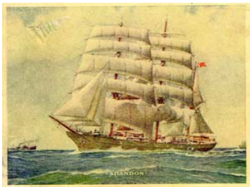
Shandon under full sail