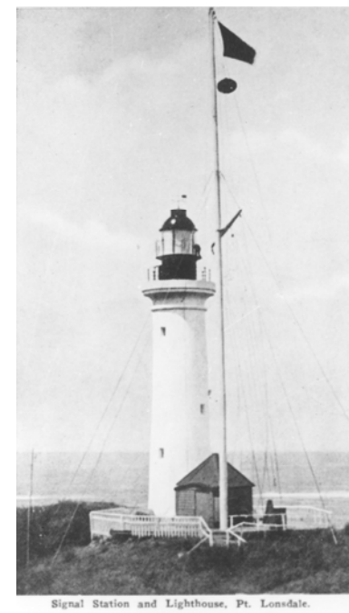
Signal Station and Lighthouse, Pt. Lonsdale.

Watch the local press and QMM website for more information.